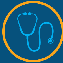
Alternative clinician coverage