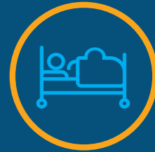
OB/GYN clinic coverage