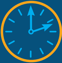
Part-time physician coverage

While OBHG's traditional full-time and part-time OB hospitalist models are the right fit for many hospitals, others need something different. OBHG's Maternal Health Access Solutions alternative options are customized to meet the needs of each individual hospital. Many of these options can be paired together.